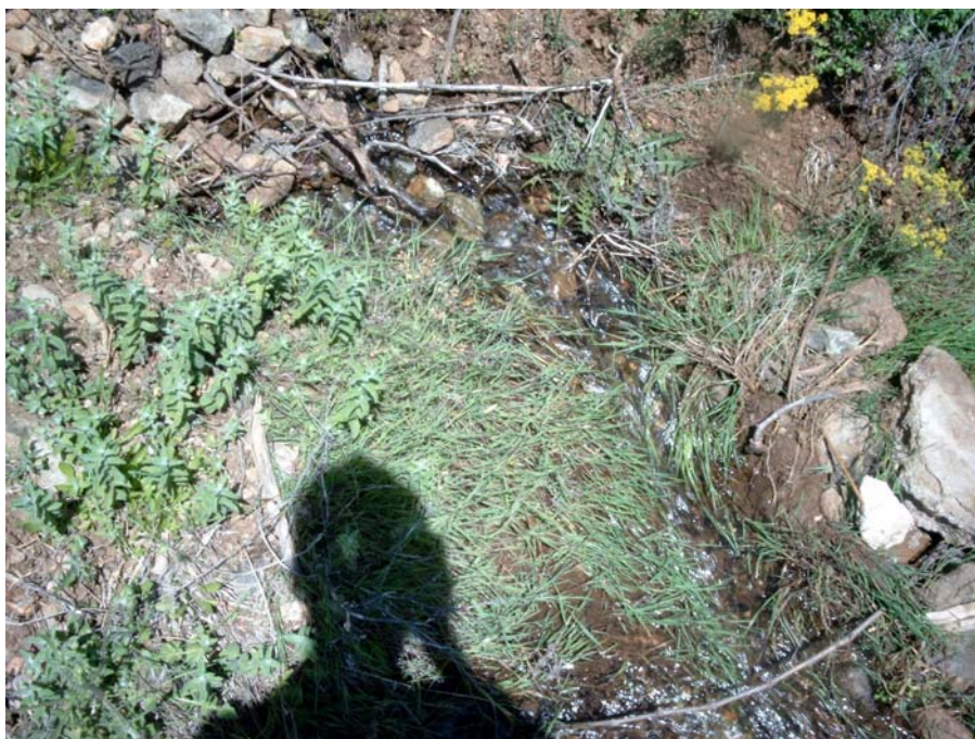
Figure 5. Guri i Kuq under the tunnel

As shown, the moss is an indicator of environmental pollution, where micro-elements like Ni, Cr, Pb and Zn are concentrated.