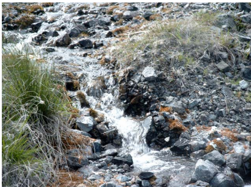
Figure 2. Water flow from Pojska chromium mine

The samples for the assessment of harmful and toxic elements in water, were taken in the outpouring of the waters, the so called "flowing channel" of the Guri i Kuq mine into the lake (sample no.4) Fig. 5, on the edge of the lake at the stockpile of slag at the train station (sample no.2) Fig. 4, in the water flowing at the stockpile of slag in Hudenisht (sample no. 3) Fig. 3, and in the flowing waters of Pojska chromium mine (sample no.1) figure 2.