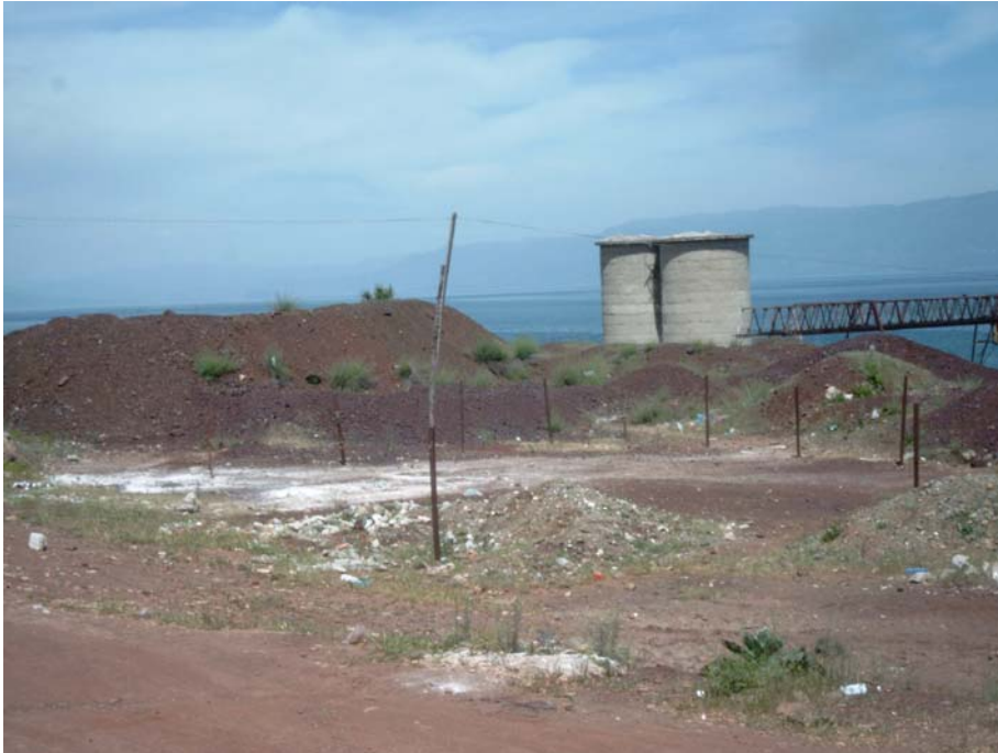
Figure 4. Railway train Station