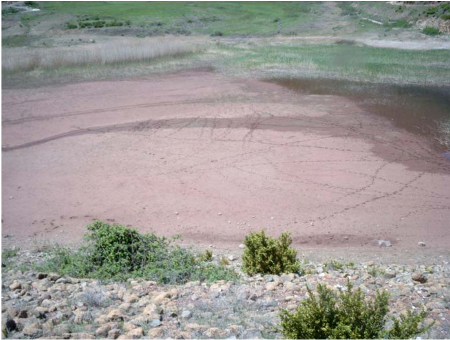
Figure 3. Hudenisht stock Pile