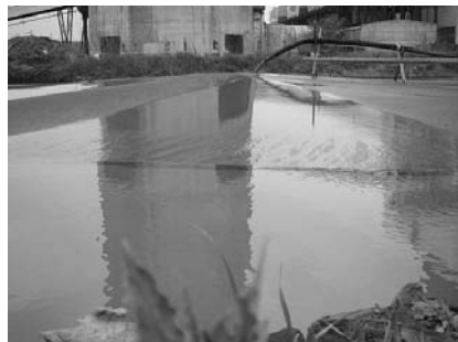
Fig. 2. Discharging of the high density hydromixture at pilot disposal site

Figure 2 and 3 show disposal site in the moment of hydromixture discharging and after conclusion of the pilot plant trial.