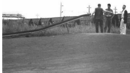
Fig. 3. Disposal site after conclusion of pilot plant investigation