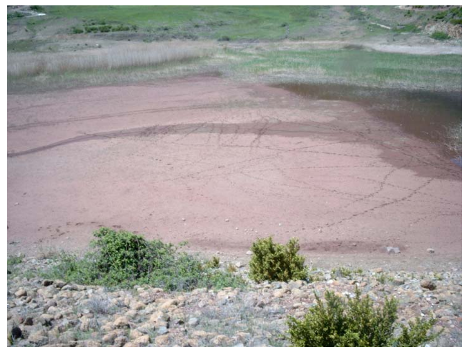
Figure 3. Hudenisht stock Pile