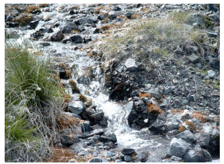
Figure 2. Water flow from Pojska chromium mine

The samples for the assessment of harmful and toxic elements in water, were taken in the outpouring of the waters, the so called "flowing channel" of the Guri i Kuq mine into the lake (sample no.4) Fig. 5, on the edge of the lake at the stockpile of slag at the train station (sample no.2) Fig. 4, in the water flowing at the stockpile of slag in Hudenisht (sample no. 3) Fig. 3, and in the flowing waters of Pojska chromium mine (sample no.1) figure 2.