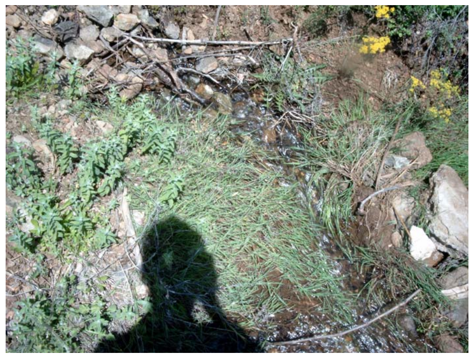
Figure 5. Guri i Kuq under the tunnel

As shown, the moss is an indicator of environmental pollution, where microelements like Ni, Cr, Pb and Zn are concentrated.