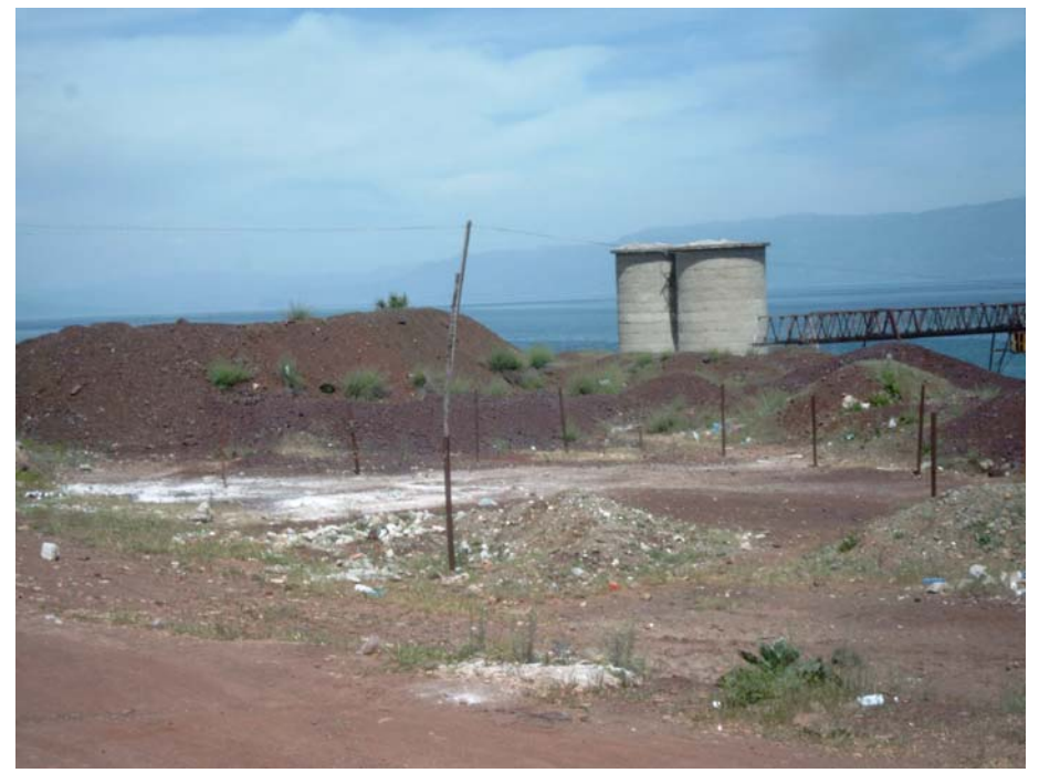
Figure 4. Railway train Station